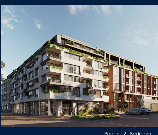
Roden: 2 - Bedroom