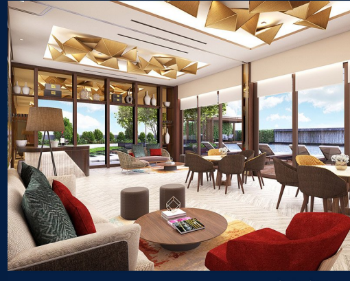
2 - Redroom