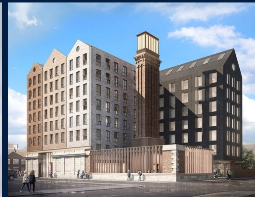
1 - Bedroom