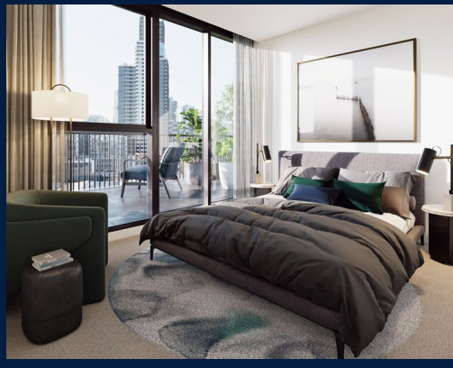
Roden: 3 - Bedroom