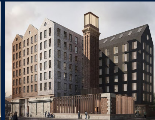
1 - Bedroom Duplex