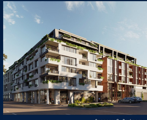
Spencer: 2 - Bedroom