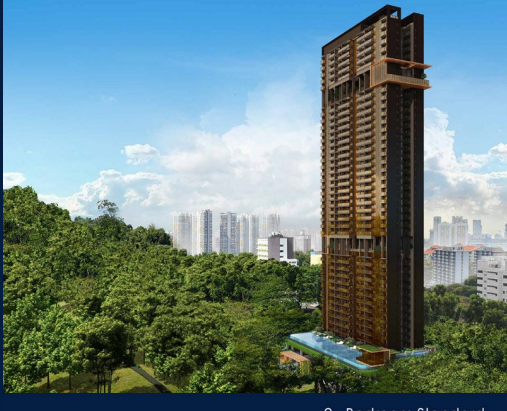
2 - Bedroom Standard